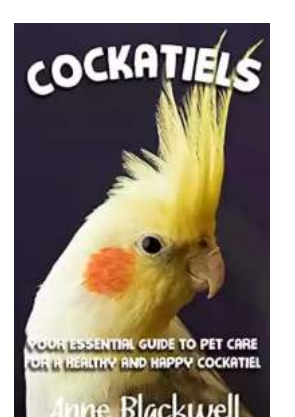
Cockatiels: Your Essential Guide to Pet Care for a Healthy and Happy Cockatiel

Caring for a cockatiel can be a rewarding experience, but it requires commitment and knowledge. By providing a suitable cage, a balanced diet, a comfortable environment, socialization, mental stimulation, proper healthcare, and regular exercise, you will ensure your cockatiel lives a healthy and happy life. Remember, a well-cared-for cockatiel is a joyful and loving companion that will bring you countless moments of happiness.