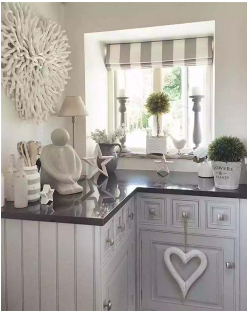
A Cozy Retreat

Our kitchen is always filled with the comforting aroma of home-cooked meals. The sizzle of onions in a hot pan, the delicate scent of freshly baked bread, and the rich aroma of spices infusing a simmering curry - these smells evoke a sense of comfort and belonging, reminding us of the love and care that goes into each dish.