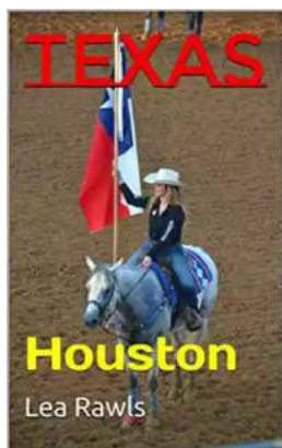
Photo Book 245" effortlessly captures the essence of Houston's past, present, and future. With its comprehensive collection of stunning visuals and captivating narratives, this photo book unveils the beauty of the Lone Star State in all its glory.